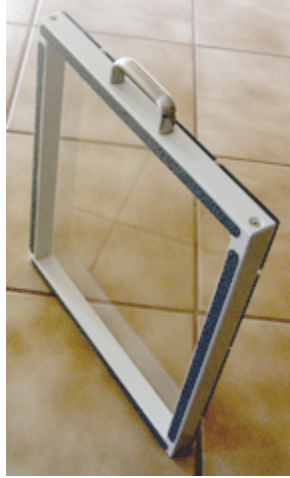
10 x 12 Cassette Protector