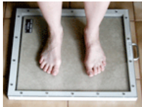
14 x 17 Cassette Protector